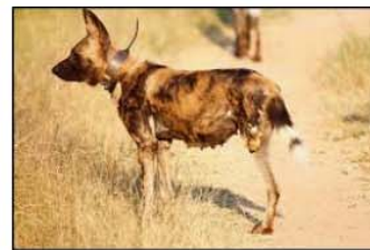
Snare Hunting: What's the Catch ... wildlifeact.com