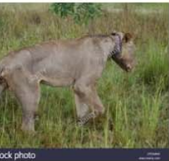
lion Panthera leo with a ...