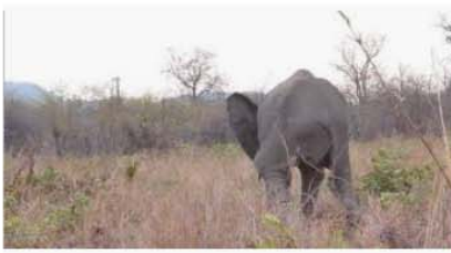
Elephant snares — Expedition Art expeditionart.org