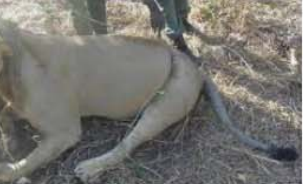
photos show lion SLICED OPEN ... o.uk