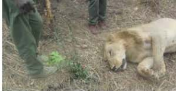
Horrifying photos show lion SLICED OPEN ... express.co.uk