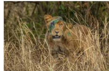
greatest threat to African lions nationalgeographic.com