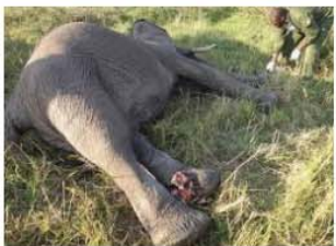
African Animals from Snares ... greatergood.org