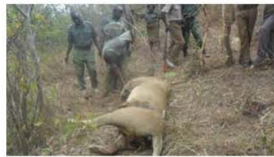
Horrifying photos show lion SLICED OPEN ...