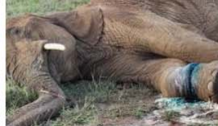
Elephant snare rescue - Africa Geogra... africageographic.com