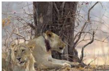
Illegal hunting threatens iconic ... news.mongabay.com