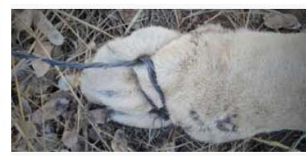
Snares to Wares - Center for Global ... canr.msu.edu