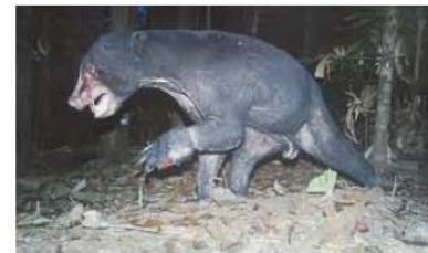
Wire snares in the jungle inflict ... star2.com