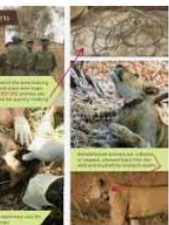
Snare Jewelry - Conser... com