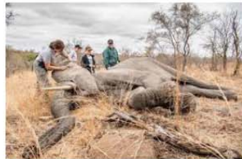
Snare Poaching: A Growing Conservation ... singita.com