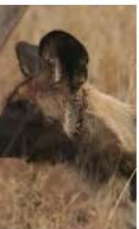
wild dog ... wilddogs.wordpr...