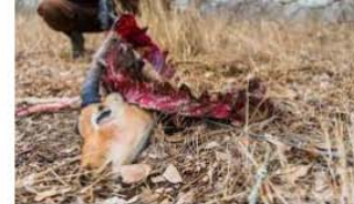
Snares Decimate Africa's Wildlife ... peterchadwick.co.za