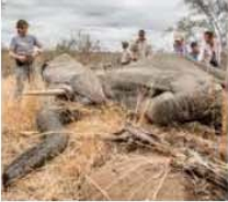
Snare Poaching: A Growing Conservation ... singita.com