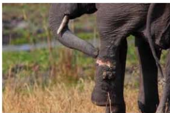
Liwonde Elephant Habitat Project untoldafrica.com