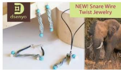
Snare Wire Jewelry - Conserving African ... kickstarter.com