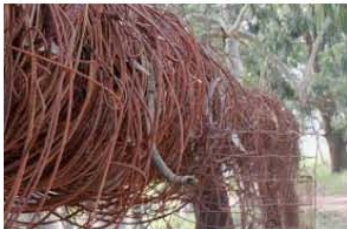
The horror of snares - Africa Geographic africageographic.com