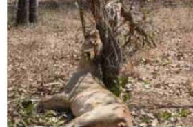
Snares, the silent killer of Africa's ... africahunting.com