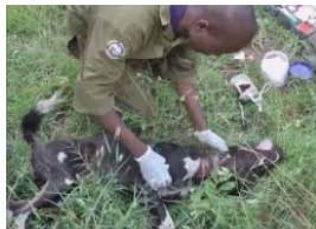
Wild Dog Caught by Snare Receives H... youtube.com